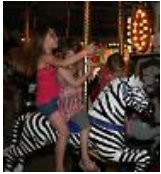
Children enjoy the new Amusement Company