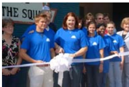
Café on the Square