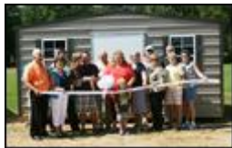
Attala Portable Buildings

The Kosciusko Attala Development Corporation was founded in October 2007. The purpose of the KADC is to aid, assist and promote the development and expansion of the business, employment, and cultural opportunities in Attala County, Mississippi, by such means as the Board of Directors may deem best, including but not limited to providing assistance to the economic development of Attala County, Mississippi.