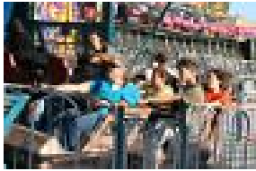
Rides were a huge hit at the 100th CMF