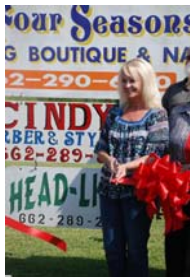
Cindy's Barber & Style