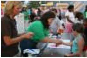
Bracelets being put on Moomba participants

Even with a little rain the 39th Natchez Trace Festival took place. Family Night was wonderful weather with "Lost Highway" playing to a crowded M & F Park. The Moomba was the happening place for the kids and food